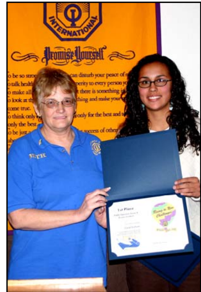
Coral Cullum Academy for Academic Excellence 1 st Place

Following the awards and announcement that Coral Cullum was also the winner of 1 st Place for the Zone 4 competition, the meeting was closed with everyone joining in to recite the Optimist Creed.